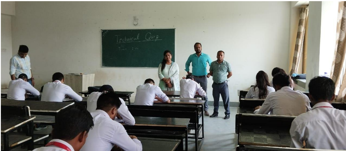
Participated during Quiz competition