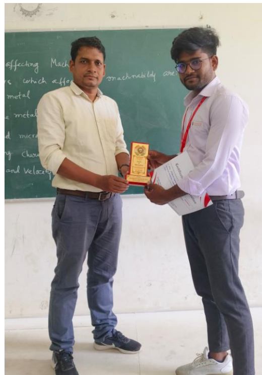
Winners and Prizes: